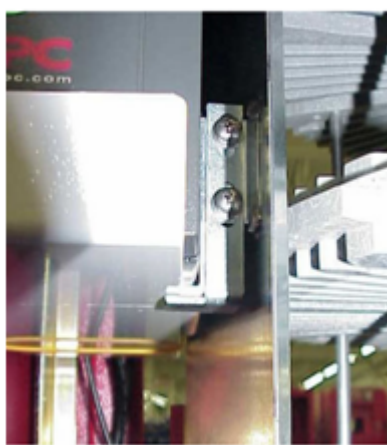
Diagram 1.1 Loop Under Battery